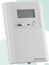
Space w/Setpoint, Override & LCD