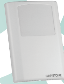
Space w/ No Options